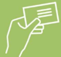
Referral & linkage