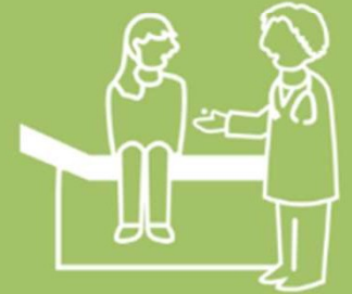
Medication Assisted Treatment