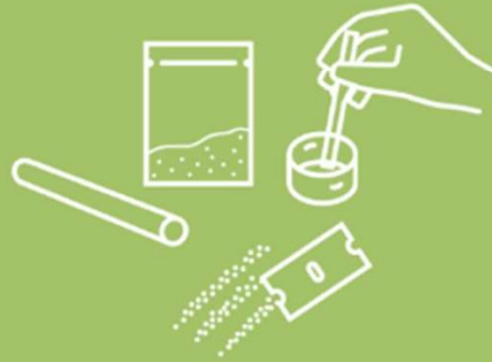
Safer Drug Use