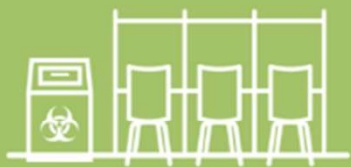
Supervised Consumption Services