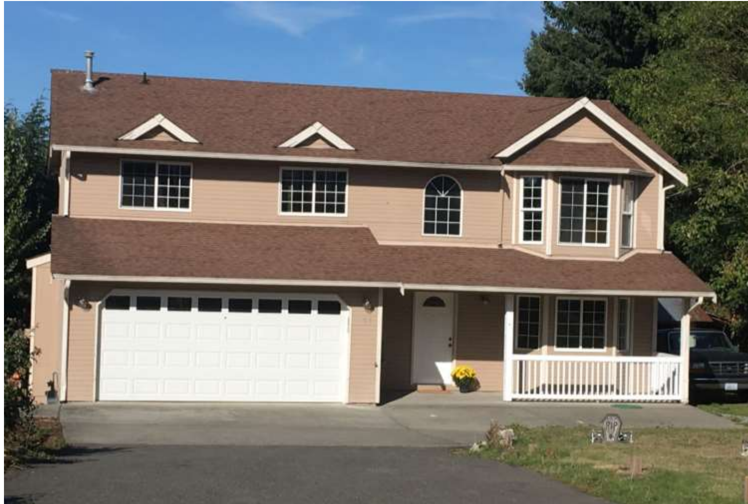
Kate's House Foundation – Burien, WA